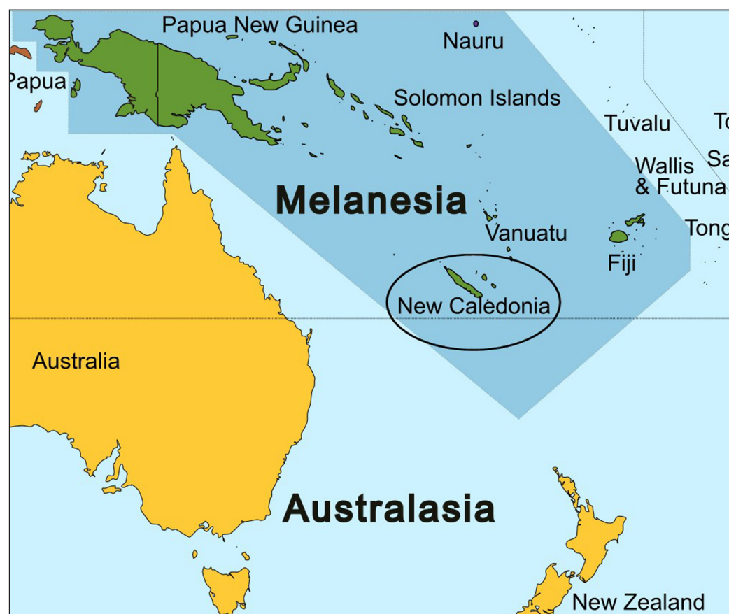
Figure 1 New Caledonia in the South Pacific.

Paicî (IPA /paicî/) is a Central-Eastern Oceanic language spoken in New Caledonia (NC), a French-speaking dependency in the western South Pacific (Figure 1). Paicî is spoken by around 6,500 people in a 40 km-wide band across the center-north part of the mainland (Figure 2), bordered